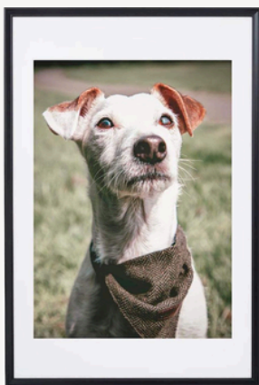
The recommended choice

Here is an idea of what your finished prints will look like if you choose a frame. With and without a border. These borders are added into the photo prior to printing.